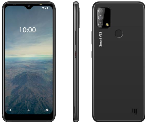
Smart V22 GH6821